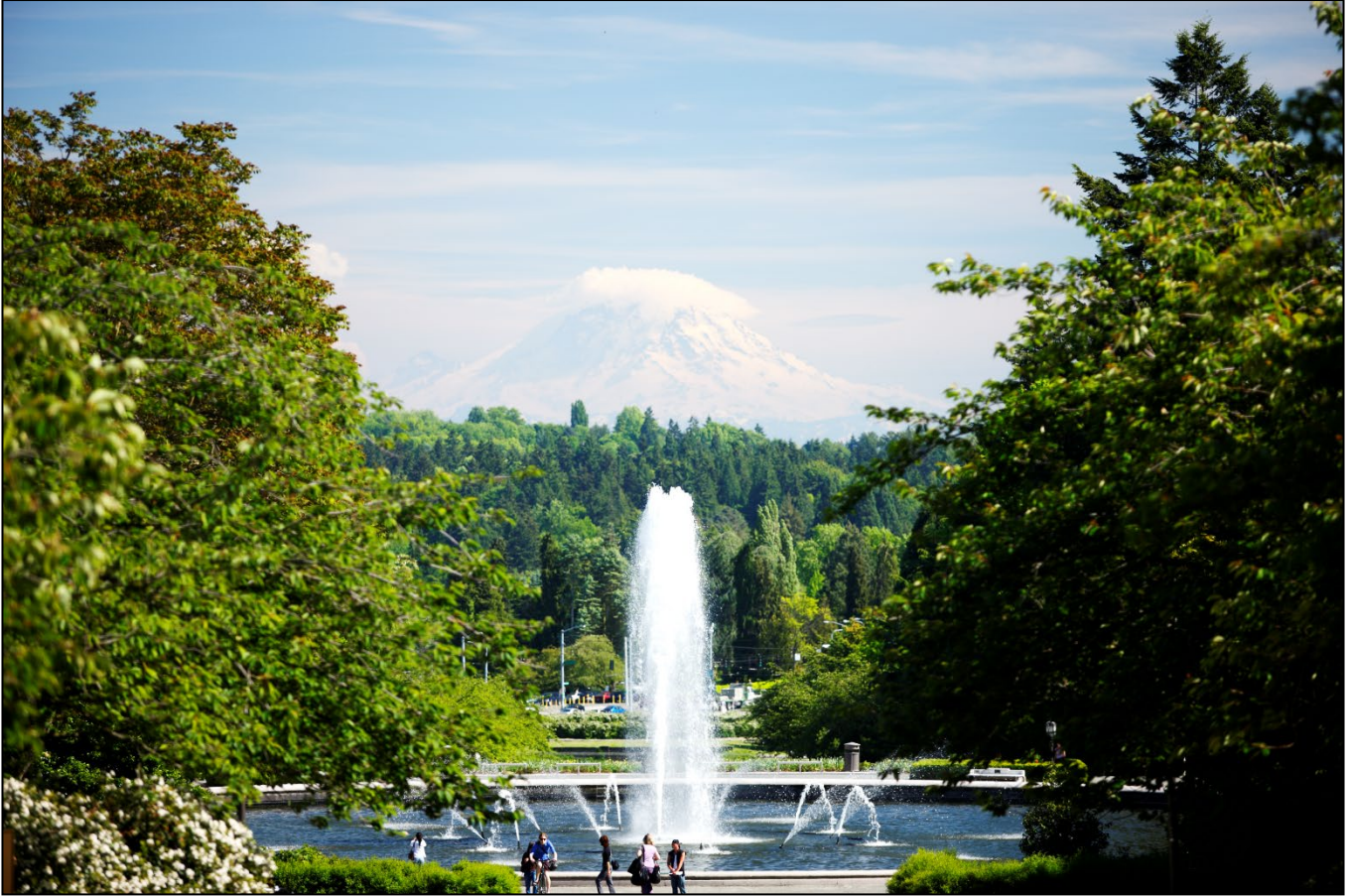
Drumheller Fountain with Mount Rainier in the background